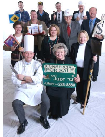
2007-2008 Board of Directors