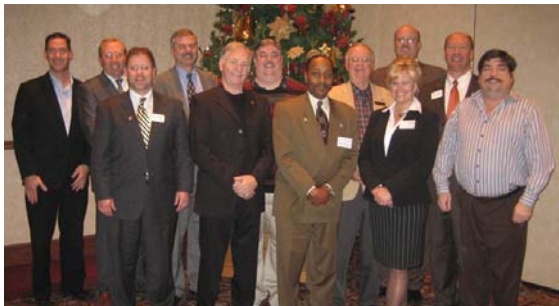
Investor's Meeting, Nov 2007