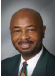
Mayor Carson Ross